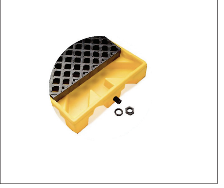
Bulkhead Fittings allow spills to flow to adjacent sump areas, increasing containment capacity while maintaining a low profile.