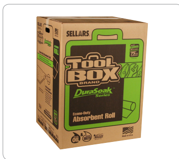
DuraSoak® Roll Outer Case

Caution: Not intended for use with aggressive acids or caustics. Dispose of all sorbent materials in accordance with local, state and federal regulations.