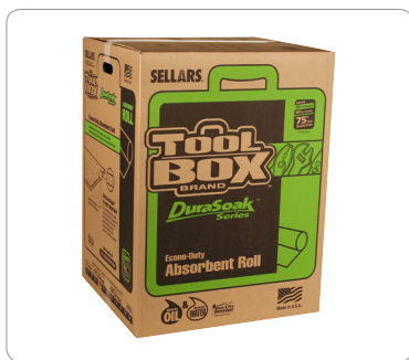
DuraSoak® Roll Outer Case

Caution: Not intended for use with aggressive acids or caustics. Dispose of all sorbent materials in accordance with local, state and federal regulations.