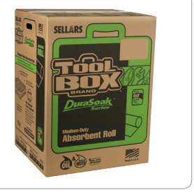
DuraSoak® Split Rolls Outer Case

*absorbency results were independently tested by SF Analytical Laboratories using ASTM method F726-06 using SAE 30 motor oil