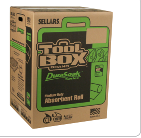
DuraSoak® Roll Outer Case

*absorbency results were independently tested by SF Analytical Laboratories using ASTM method F726-06 using SAE 30 motor oil