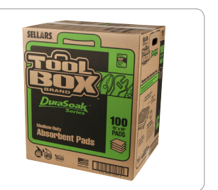
DuraSoak® Pads Outer Case

Caution: Not intended for use with aggressive acids or caustics. Dispose of all sorbent materials in accordance with local, state and federal regulations.