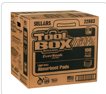
EverSoak® Light-Duty Absorbent Pads Outer Case

Caution: Not intended for use with aggressive acids or caustics. Dispose of all sorbent materials in accordance with local, state and federal regulations.