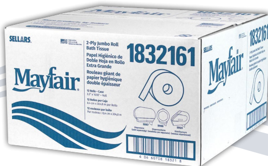
2-Ply Jumbo Roll Bath Tissue (1000') Outer Case