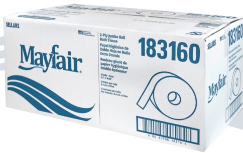
2-Ply Jumbo Roll Bath Tissue (1680') Outer Case