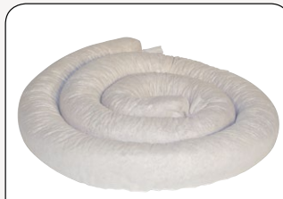
EverSoak® OIL ONLY 8' Cotton Absorbent Sock