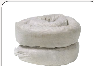
EverSoak® OIL ONLY 4' Cotton Absorbent Sock