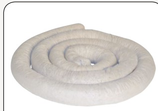
EverSoak® OIL ONLY 12' Cotton Absorbent Sock