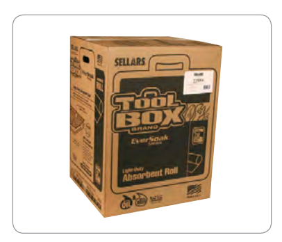
EverSoak® Light-Duty Absorbent Roll Outer Case