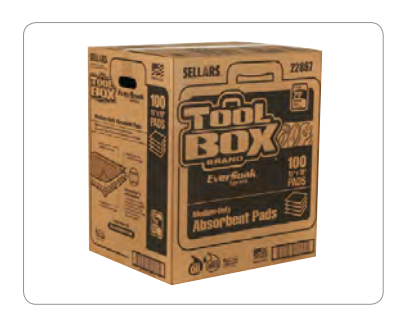
EverSoak® Medium-Duty Absorbent Pads Outer Case