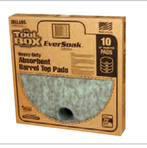
Perforated box opens to become a handy dispenser.