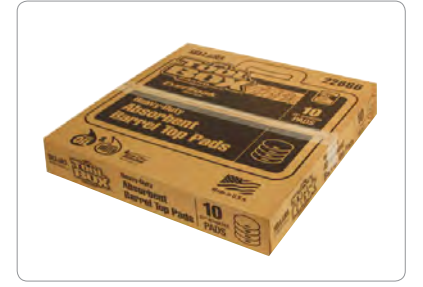
EverSoak<sup>®</sup> Heavy-Duty Barrel Top Pads Outer Case

Caution: Not intended for use with aggressive acids or caustics. Dispose of all sorbent materials in accordance with local, state and federal regulations.