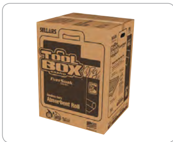
EverSoak® Medium-Duty Absorbent Roll Outer Case

Caution: Not for use with aggressive acids or caustics. Dispose of all sorbent materials in accordance with local, state and federal regulations.