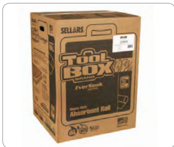
EverSoak® Heavy-Duty Absorbent Roll Outer Case

Caution: Not intended for use with aggressive acids or caustics. Dispose of all sorbent materials in accordance with local, state and federal regulations.