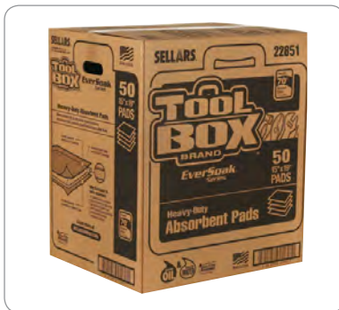
EverSoak® Heavy-Duty Pads Outer Case