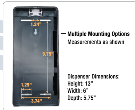
Back view of dispenser