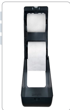
Inside view of dispenser