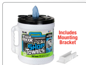
Z400 BIG GRIP® Bucket of Shop Towels