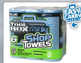
Z400 Roll of Shop Towels 6PK