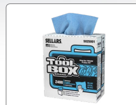
Z400 Interfold Shop Towels