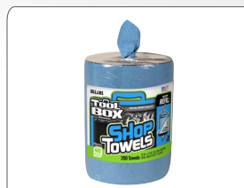
Z400 BIG GRIP® Refill of Shop Towels