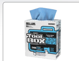
Z400 Interfold Shop Towels