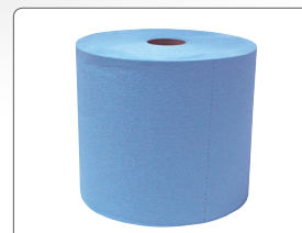
Z400 Jumbo Roll of Shop Towels