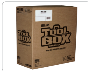
Z400 Interfold Outer Case