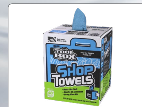
Z400 Box of Center-Pull Shop Towels