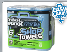
Z400 Roll of Shop Towels 6PK