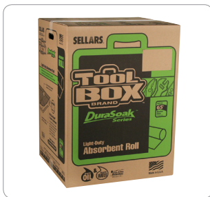
DuraSoak® Roll Outer Case

*absorbency results were independently tested by SF Analytical Laboratories using ASTM method F726-06 using SAE 30 motor oil