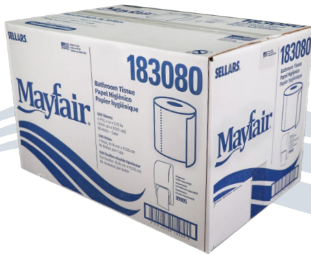
2-Ply Bath Tissue (500ct) Outer Case