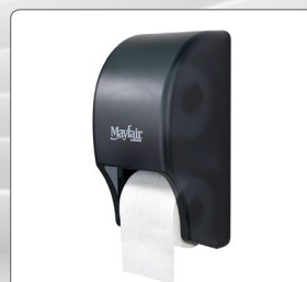
Standard Bath Tissue Dispenser