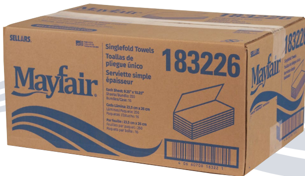
Natural Singlefold Towels Outer Case