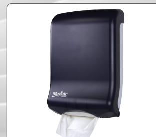
Multi-Fold/C-Fold Towel Dispenser