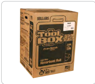
EverSoak® Light-Duty Absorbent Split Rolls Outer Case

Caution: Not intended for use with aggressive acids or caustics. Dispose of all sorbent materials in accordance with local, state and federal regulations.