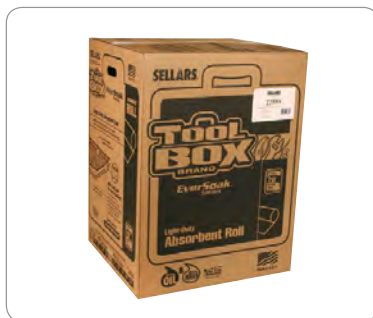
EverSoak® Light-Duty Absorbent Roll Outer Case

Caution: Not intended for use with aggressive acids or caustics. Dispose of all sorbent materials in accordance with local, state and federal regulations.