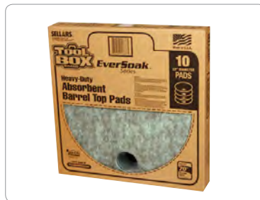
Perforated box opens to become a handy dispenser.