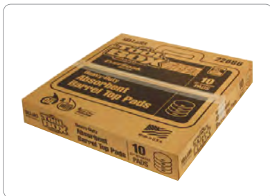
EverSoak® Heavy-Duty Barrel Top Pads Outer Case