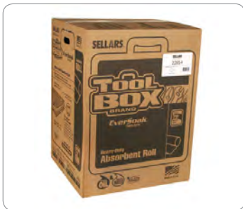
EverSoak® Heavy-Duty Split Rolls Outer Case

Caution: Not intended for use with aggressive acids or caustics. Dispose of all sorbent materials in accordance with local, state and federal regulations.