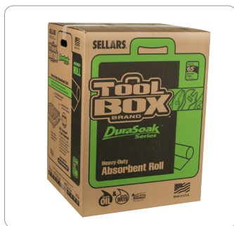
DuraSoak® Roll Outer Case

Caution: Not intended for use with aggressive acids or caustics. Dispose of all sorbent materials in accordance with local, state and federal regulations.