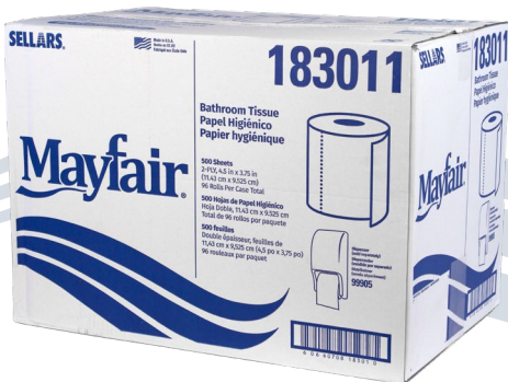
2-Ply Bath Tissue (500ct) Outer Case