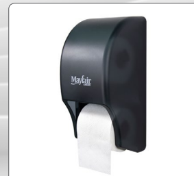
Standard Bath Tissue Dispenser