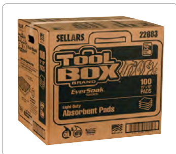
EverSoak® Light-Duty Absorbent Pads Outer Case